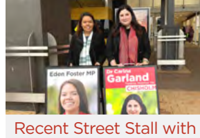
Recent Street Stall with Carina Garland MP Federal Member for Chisholm