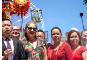
Springvale Lunar New Year Festival