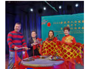
Dragon Boat Festival