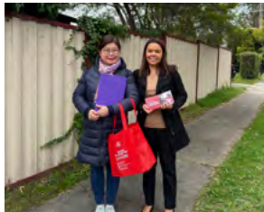
Doorknocking with local volunteers