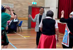
Springvale Italian Senior Citizen Club Culture Day

I've been getting around to a number of small businesses in our local community recently.